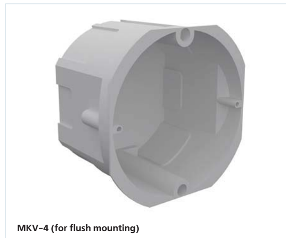
MKV-4 (for flush mounting)